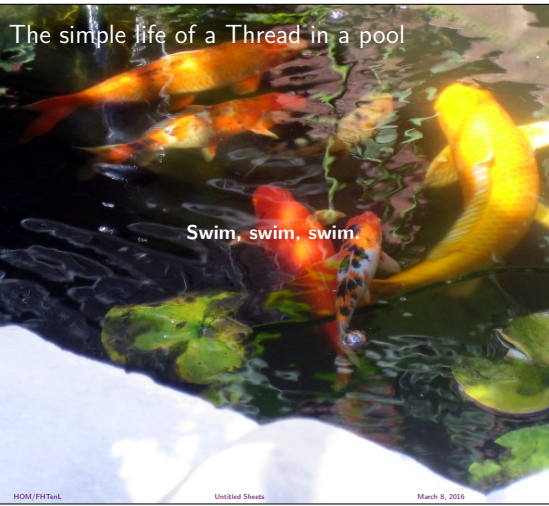
The simple life of a Thread in a pool